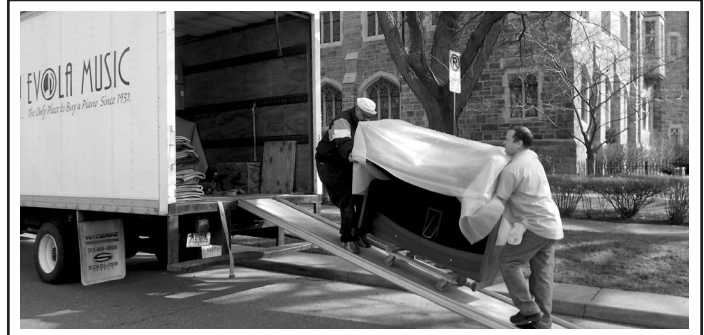
Our new chapel organ being unloaded by Evola Music on April 14.

This year, our church has purchased a new digital organ for the chapel. We have purchased an instrument manufactured by the Allen Company. Our previous instrument was over 30 years old and giving a lot of trouble. (This is young for a pipe organ, but not for an electronic instrument!) Our new instrument features sampled sounds of organ pipes, so it will sound and feel more authentic and have a considerably larger and clearer pallet of sound color. Also, we are installing several external speaker cabinets to distribute the sound better in the chapel and make the sound of the organ project into Dodge